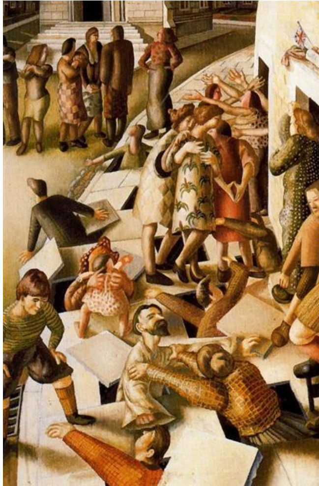
‘The Resurrection with the Raising of Jairus’ Daughter’ by Stanley Spencer

NAUMAI, HAERE MAI! MALO E LELEI! TALOFA! 欢迎 (HUĀN YÍNG!)