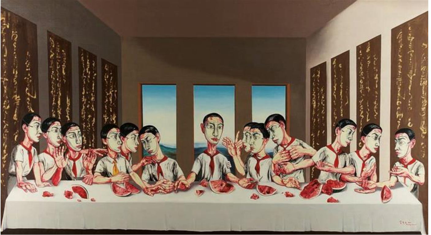
‘Тайная вечеря’ (The Last Supper) by Zeng Fanzhi (2001)

NAUMAI, HAERE MAI! MALO E LELEI! TALOFA! 欢迎 (HUĀN YÍNG!)