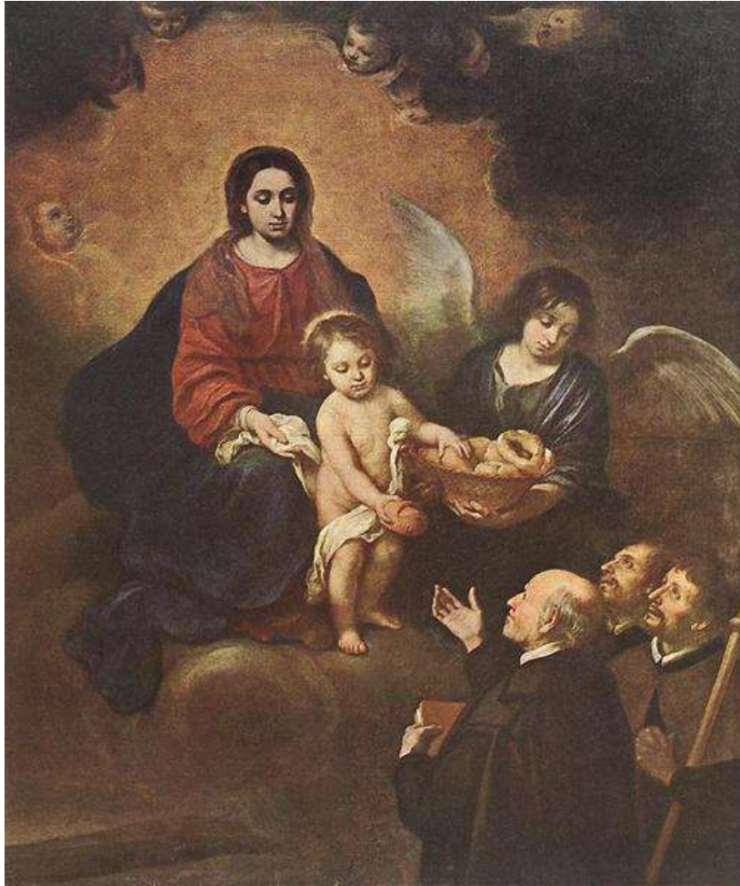
'The Infant Jesus Distributing Bread to Pilgrims' Murillo (1678)

NAUMAI, HAERE MAI! MALO E LELEI! TALOFA! 欢迎 (HUĀN YÍNG!) Welcome all who are with us in person or online