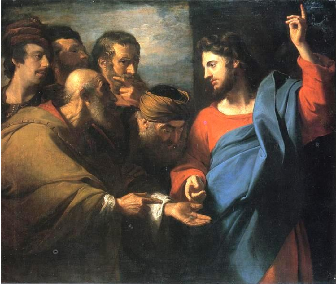
'The Tribute Money' by John Singleton Copley (1782)

NAUMAI, HAERE MAI! MALO E LELEI! TALOFA! 欢迎 (HUĀN YÍNG!)