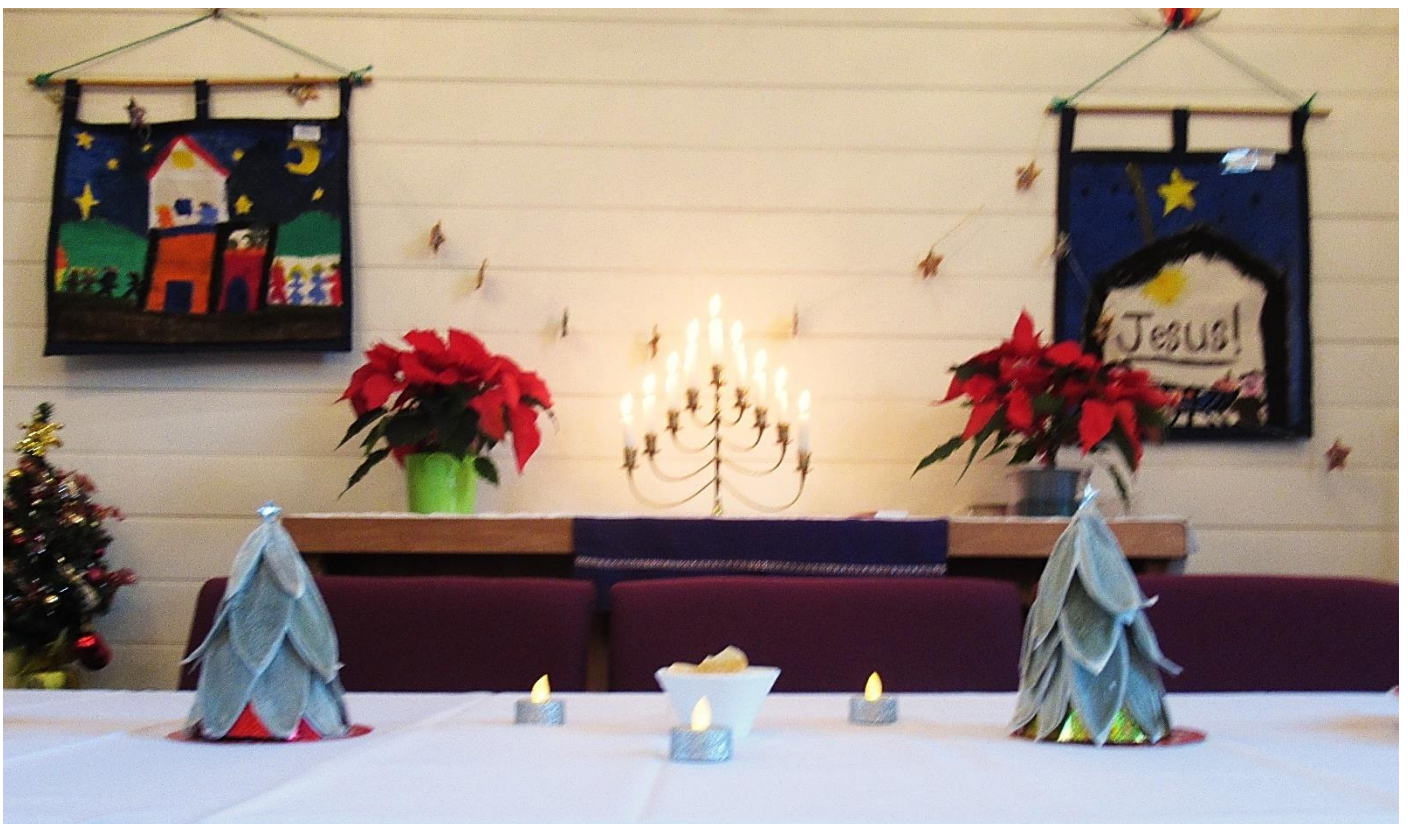
Café Carols at All Saints

Bring your own printed copy if you wish.