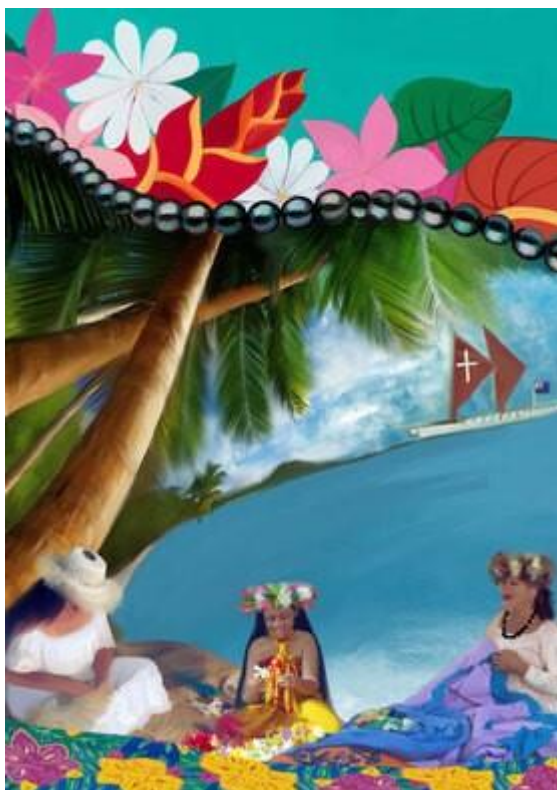
Artwork provided by the World Day of Prayer New Zealand